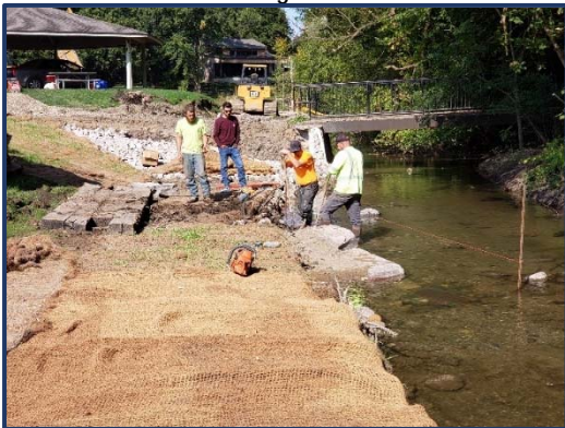
September 21, 2020 Rock vane construction begins