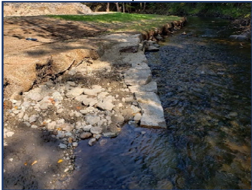
September 23, 2020 Rock vane construction complete