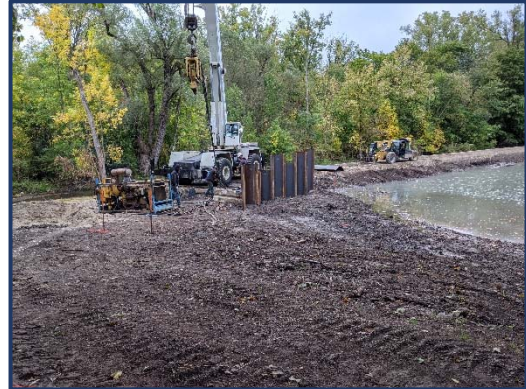
September 30, 2020 Sheet piling installation begins