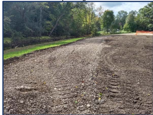
September 30, 2020 Installation of access path begins