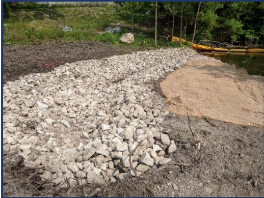
September 16, 2020 Step pool construction begins